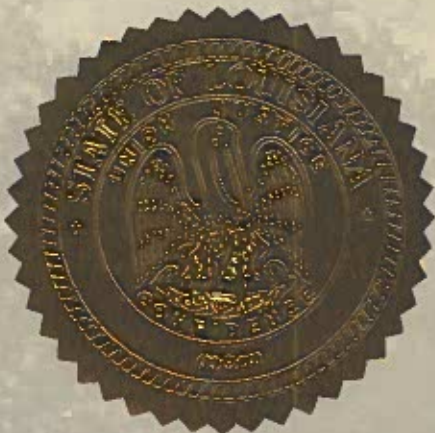
John Bel Edwards Governor

IN WITNESS WHEREOF, I have hereunto set my hand officially and caused to be affixed the Great Seal of the State of Louisiana, at the Capitol, in the City of Baton Rouge, on this 20th day of February A. D., 2022.